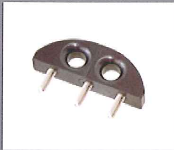
LOOP® Organizer 13-26, base brick with blind thread

Our KOHLHOFF LOOP® Organizer is available in two different sizes and any different length you like!