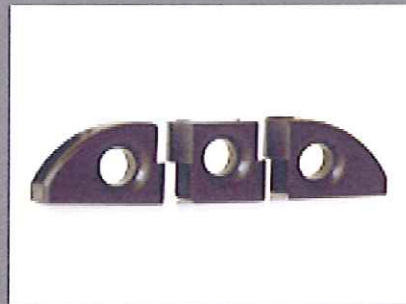
Additional bricks can be added