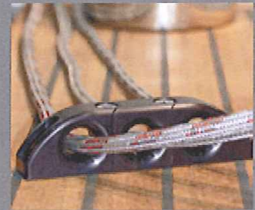
LO 18-26 as a triple version mounted on deck